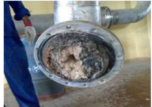
Fig. 1. Clogging of a post digestion pipe by struvite at a treatment plant (location confidential)

Fig. 1 illustrates occasions where struvite was formed in the piping at treatment plants.